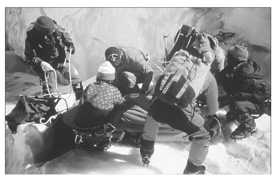
Figure 16.1 Stretcher casevac in the Khumbu Icefall on Everest in winter. The victim had bilateral compound fractures of tibia and fibula from the fall

A similar but more personalised document pack should be produced for each expedition member. This should be kept readily available together with a passport and some cash, credit cards or other financial guarantee. An emergency casevac may separate an individual from the rest of the party and these documents should accompany the injured party. This "snatch bag" can be further enhanced by including a structured proforma to allow recording of the immediate medical history, clinical