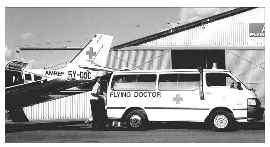
Figure 16.2 Aeromedical evacuation (S. R. Anderson)

communications, although in regions that are frequently overflown, such as the Denali National Park in Alaska, ground-to-air UHF systems can provide an effective alternative for emergency transmissions.