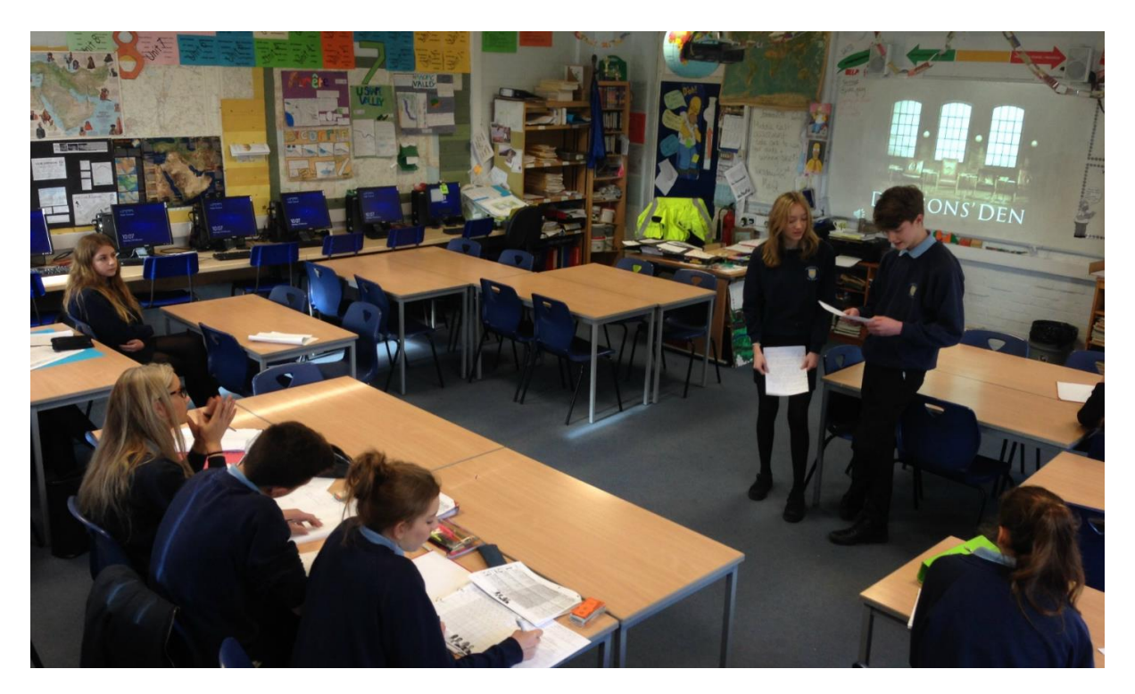
GCSE students presenting their decisions to the 'Dragons', a panel of their peers

This approach proved to be popular with students, indicated by very positive feedback in student surveys and debriefs.