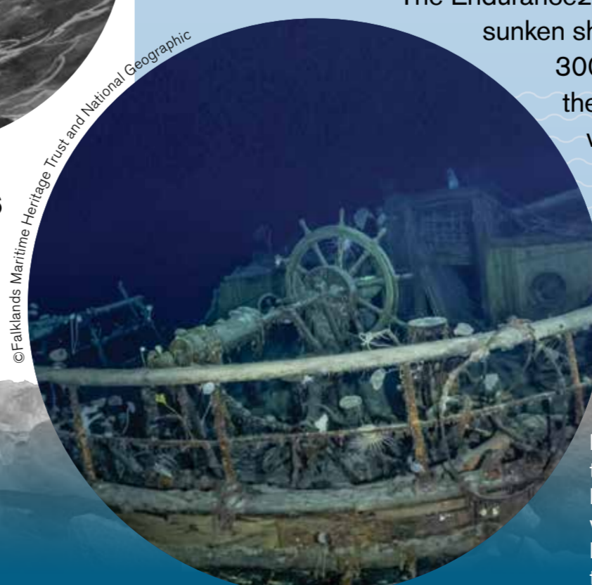
The Endurance22 team

The Endurance22 team found the sunken ship in March 2022, 3008 metres beneath the surface of the Weddell Sea. It was teeming with bizarre ocean life, and was "upright, well proud of the seabed, intact, and in a brilliant state of preservation."