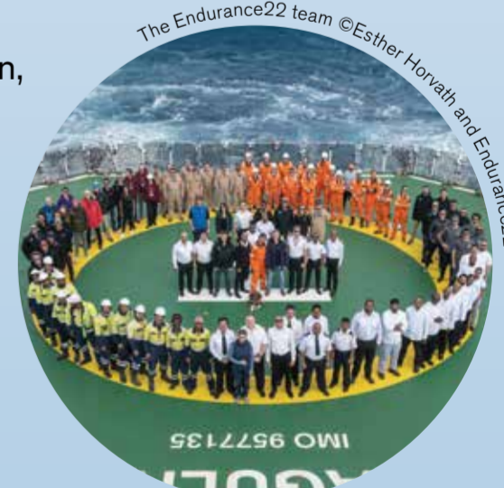
The Endurance22 team