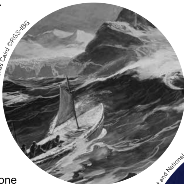
The James Caird

The expedition was an audacious challenge which led to Endurance being trapped in sea ice and crushed. It sank to the bottom of the Weddell Sea in November 1915. The stranded crew trekked to the edge of the sea ice, then sailed in the ship's salvaged lifeboats to Elephant Island where there were seals and penguins to eat. Shackleton and Worsley led a small party in one of the open lifeboats, called the James Caird , to get help. Against the odds they survived an 800-mile journey and on 30 August 1916 returned to rescue the expedition party on Elephant Island. Shackleton had saved the lives of all his men.