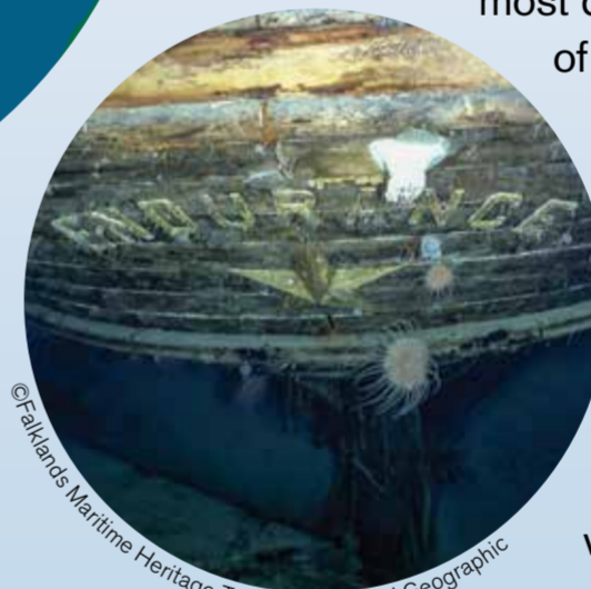
The Endurance22 team

The Endurance22 Expedition aimed to locate, survey and film the wreck of Endurance , the lost ship of polar explorer Sir Ernest Shackleton. It was the most complex subsea project ever undertaken, with several world records achieved in the process.