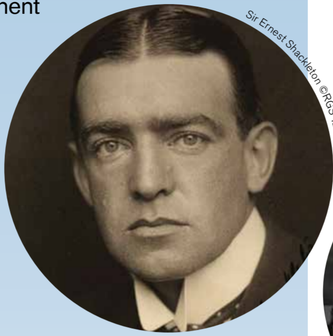
Ernest Shackleton was a keen polar explorer, born in Ireland in 1874.