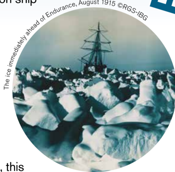
The ice immediately ahead of Endurance , August 1915

The Imperial Trans-Antarctic Expedition was Shackleton's boldest adventure: he intended to cross Antarctica from coast to coast, unsupported and on foot. At the time, this transcontinental crossing was the last great polar journey.